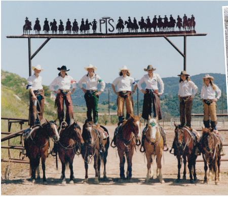
Young people and horses – great mix!