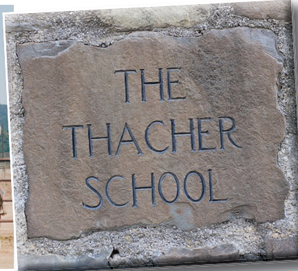
125 years of academic excellence and great horsemanship